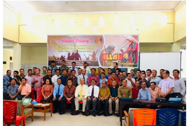
God First seminar in Kalay City of Upper Myanmar Mission/Myanmar Union Mission (left) and East Kalimantan Mission of WIUM (right)