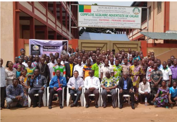
Stewardship training in Ouagadougou, Burkina Faso, February 21-27, 2019.