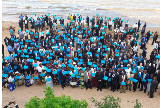
God First training of trainers in Malawi Union Conference was attended by union and conference officers, pastors from all the conferences, elders, treasurers, and stewardship leaders. Picture on right shows some delegates posing with certificates.