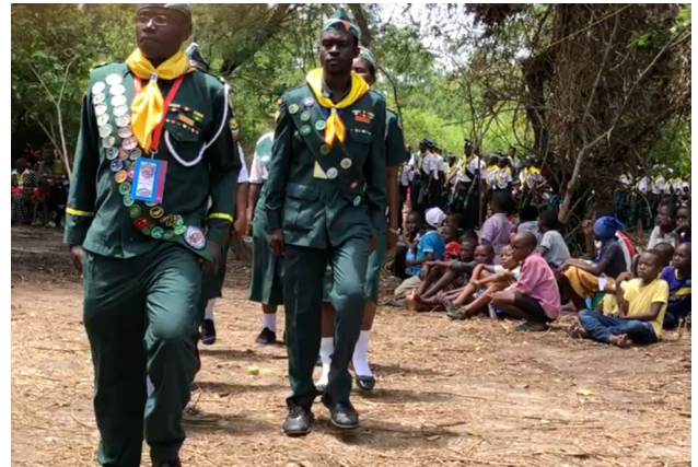
South-East Tanzania Conference youth (ECD) spent December 12-22, 2018 in the bush of Ruvu, Mlandizi Pwani, in Tanzania, studying stewardship lessons under the theme: "God First," translated in Swahili as "Mungu Kwanza" based on Matthew 6:33.