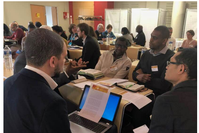
Stewardship convention for French-speaking territories, February 7-11, 2019.