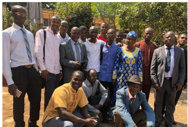
Stewardship pastors' convention in Conakry, Guinea.