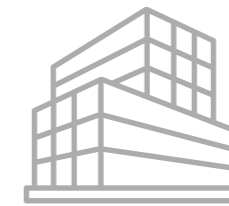
Buildings & Facilities