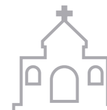
Local Church Operating Expense