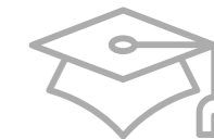
School Operating Expense